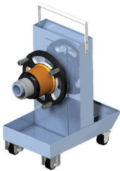
AC5525 Trolley for equipment