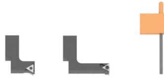
UT5538 / UT5558 Two-insert toolholder L=30 /50 mm