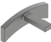
AC5681 Toolholder zero-setter dia. 360 mm