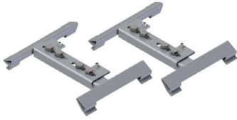
AC5280 Floating shoe clamping device