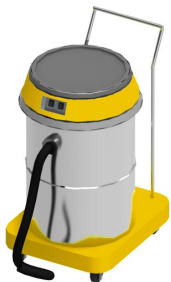
TCE050 Heavy duty dust vacuum unit