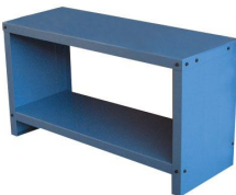
SPN8100 Base cabinet