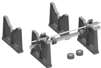
PV1516 PV1516 60° - 90° V-block blueprinting mounting fixture