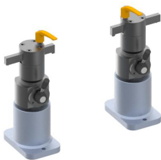
PV0025 PV0025 Pair of fast clamping column